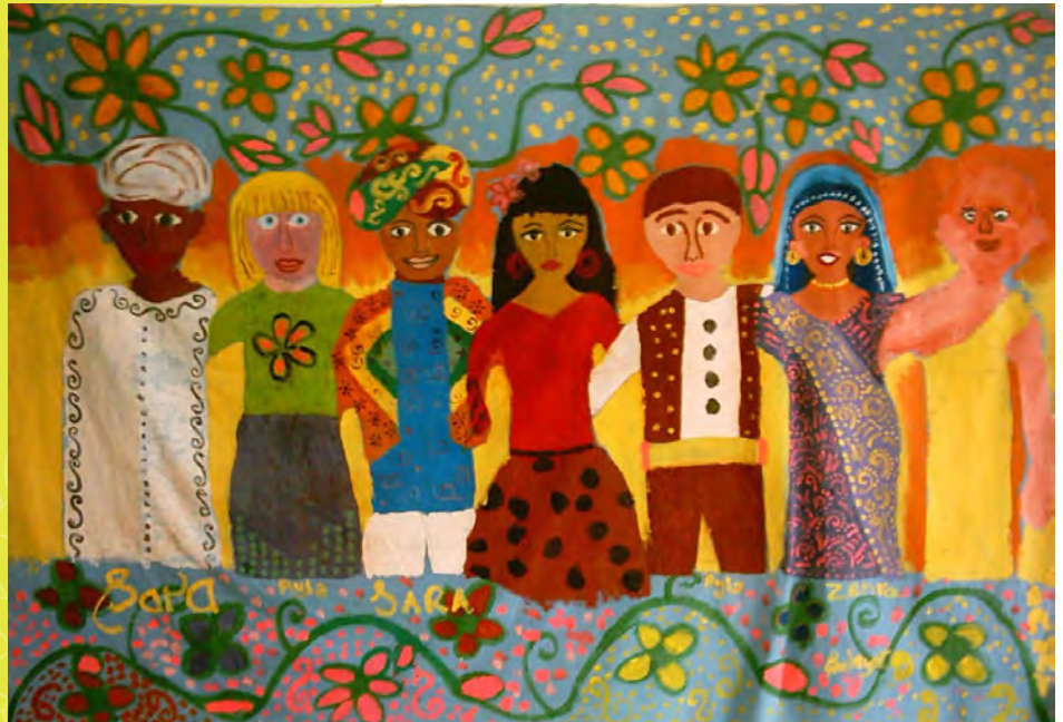
Mural by Funkor Child Art Center, Islamabad to commemorate National Children’s Day, 2005

The forum will explore the need for Malaysians to define for themselves a new, fresh approach to multiculturalism viz how to manage our plural society in ways that will bring about unity and a deeper understanding of one another’s racio-ethnic, socio-cultural and religious differences.